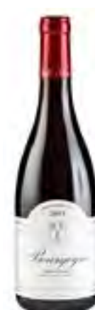
23. Bourgogne Pinot Noir, Domaine Charles Audoin, Burgundy

Bottle price (ex vat) £18.33 Bottle price (inc vat) £22.00